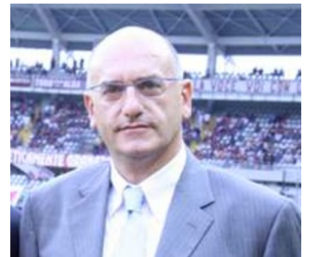
Mr. President of MSE